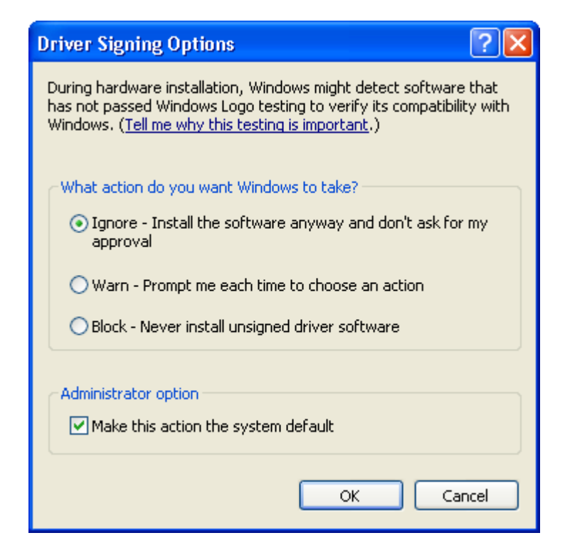
Figure 2. Driver Signing Options Window