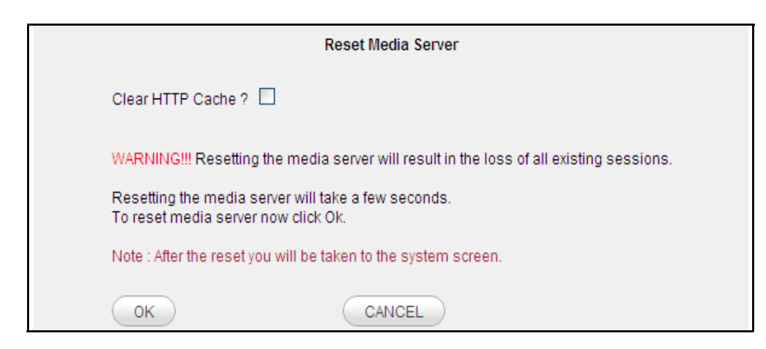
Figure 12. Reset Media Server Page

6 Click OK to reset the IP Media Server.