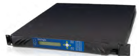
Dialogic® IMG 1010 Integrated Media Gateway