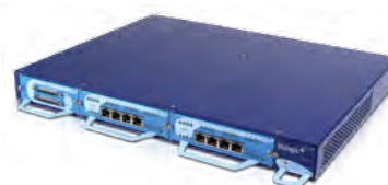
Dialogic® I-Gate® 4000 EDGE

— I-Gate 4000 PRO: Up to 16,800 simultaneous calls in a standard 300 mm ETSI chassis with E1, T1, DS3, STM1, OC-3 or mix interfaces to the PSTN and/or mobile switches and up to 3 Gigabit Ethernet ports to the IP network domain