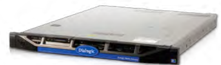
Dialogic® 4000 Media Gateway