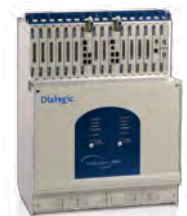
Dialogic® I-Gate® 4000 PRO