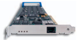
Diva Server V-PRI/E1-30 Diva Server V-PRI/T1-24

The Diva Server V-PRI/E1-30 and PRI/T124 are single-span V-Series adapters, supporting up to 30/24 concurrent calls via ISDN PRI, E1 or T1 interfaces.