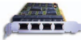
Diva Server V-4BRI-8

Diva Server V-Series adapters are all no-compromise, full-function enhanced speech and conferencing adapters that come with ample DSP resources so that every channel can employ the most processing-intensive features without limitation. Key features include VAD, generic tone detection, large conferences and full support for ASR and TTS applications with barge-in.