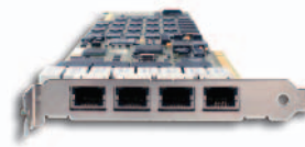
Diva Server V-4PRI/E1-120

Diva Server V-2PRI and V4PRI are dual- and quad-span V-Series adapters that provide up to 120/96 concurrent calls via up to four ISDN PRI, E1 or T1 interfaces.