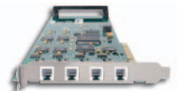
Diva Server V-Analog-4P

The Diva Server V-Analog-4P and V-Analog-8P V-Series adapters allow connection to traditional analog phone lines, so that applications and speech engines can access the PSTN in the same way that they would connect to T1/E1 or VoIP. They are programmed using the same APIs as all other Diva Server adapters.